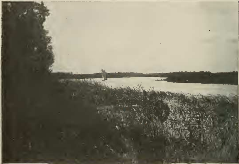
Fig. 3. The Black Channel and the Phragmites-Typha Marsh Formation. The forests in the far distance are at the edge of the main land on the other border of the marsh, more than two miles distant. Near here the Bladpates and Scoup Ducks abound on close days. Black Ducks and Mallards feed in the vegetation covered areas near.

Common from about May 1st to about October 1st. The only breeding places thus far discovered are upon Big and Little Chicken Isl-